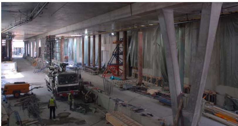
Construction works Breslauer Platz